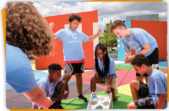
Fifth graders build collaboration skills as they create their own sports ball, game board and brand.