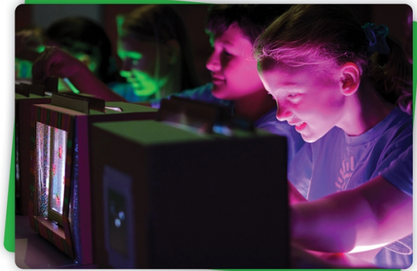
Second graders explore STEM concepts through glowing circuitry and hands-on projects.